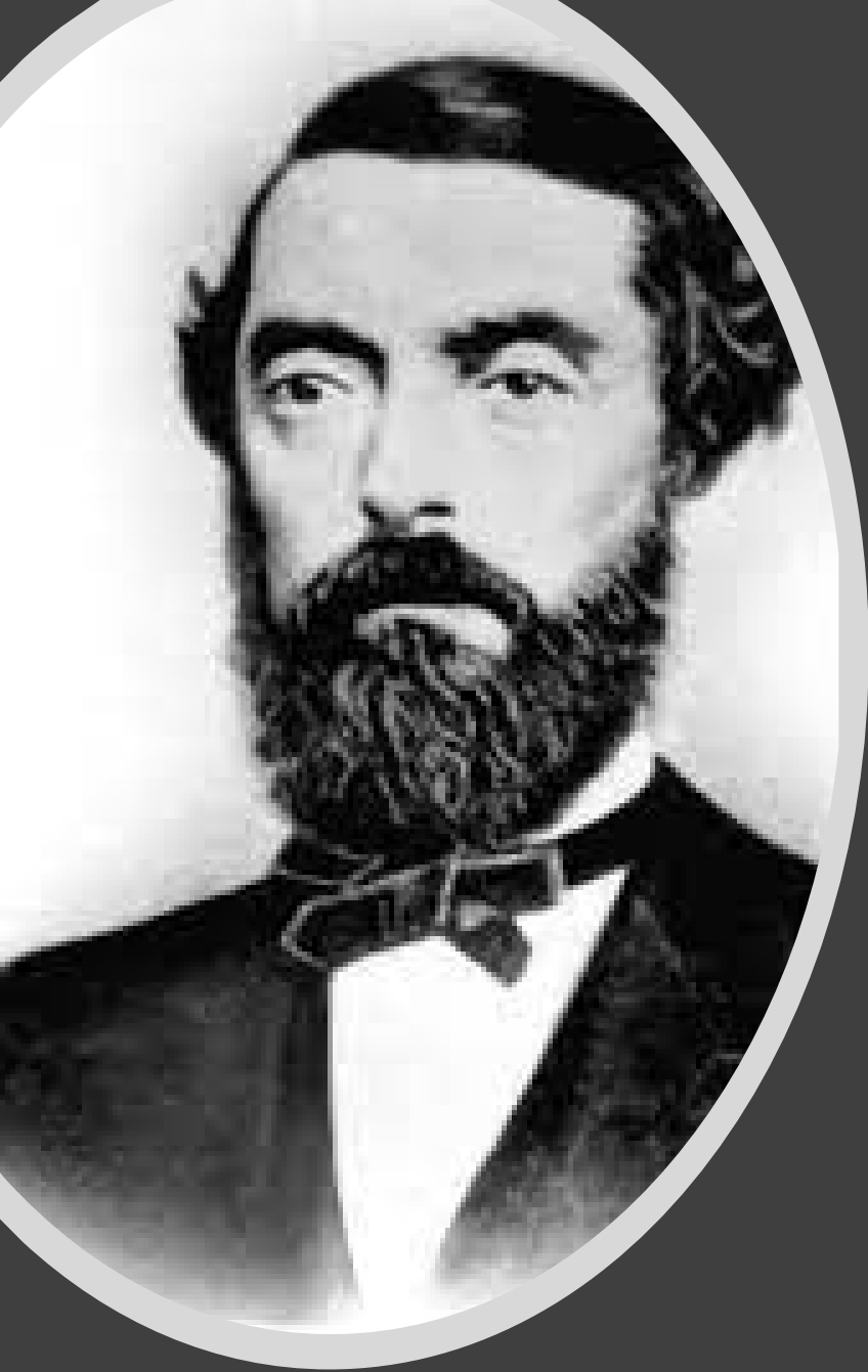
Edwin L. Drake